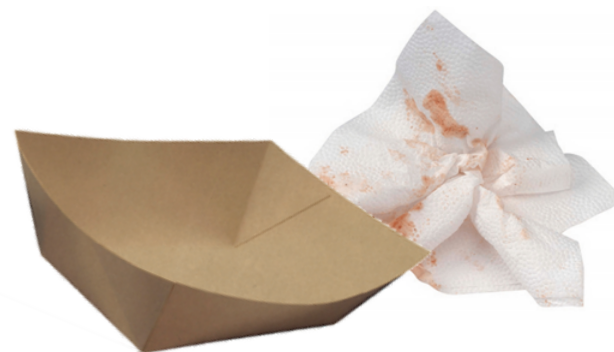
Food-soiled Paper & Cardboard Trays (Uncoated)