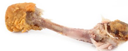
Meat & Bones