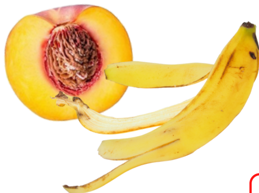
Peels & Pits