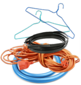
Hoses, cords, clothes hangers