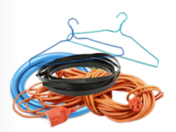
No hoses, cords, chains, clothes hangers