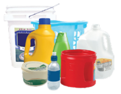
Plastic bottles & containers