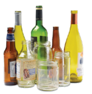
Glass bottles & jars